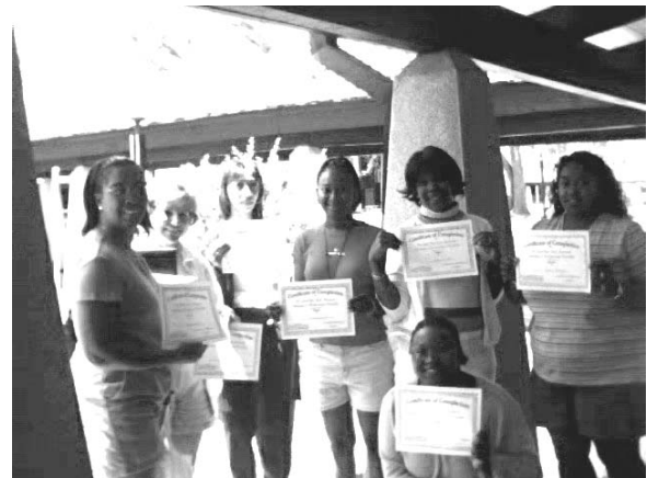
Happy people from Eglin CDC and School age program holding their certificates from the Portfolio workshop.